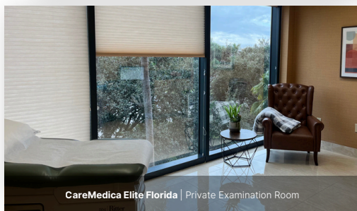
CareMedica Elite Florida | Private Examination Room

WE'RE HONORED to welcome you—and the members of your family—into our newest office location in beautiful Palm Beach Gardens, Florida. With deep-rooted connections to a wide network of trusted Floridian physicians and medical specialists, we're confident you'll receive a level of expert care that's truly unmatched.