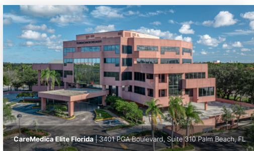
CareMedica Elite Florida | 3401 PGA Boulevard, Suite 310 Palm Beach, FL

For our DUAL-RESIDENT MEMBERS , the CareMedica Elite experience extends to our Northeast location in North Haven, Connecticut—just a short drive from Yale University and only an hour from downtown Manhattan. Our established presence in the region includes a robust network of affiliated specialists, giving members access to trusted second and third opinions from some of the Northeast's most respected medical professionals.