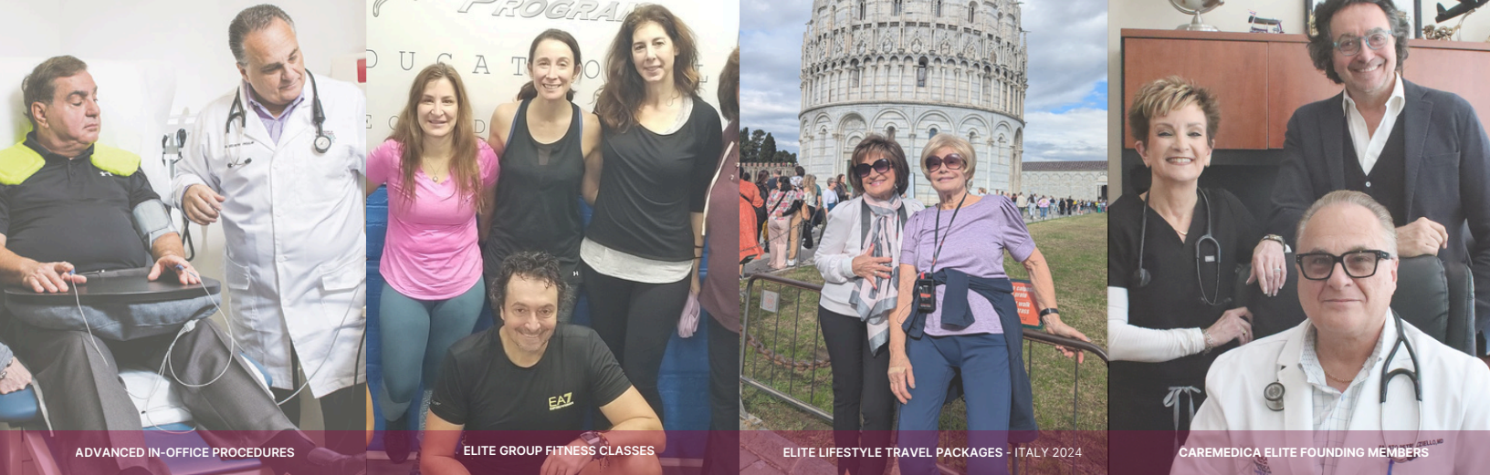
ADVANCED IN-OFFICE PROCEDURES